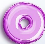
06 - Purple