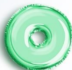
13 - Mint