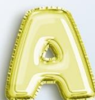
16 - Yellow