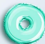
12 - Turquoise