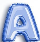
09 - Azure