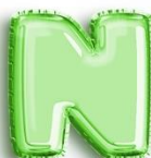
14 - Green