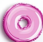
05 - Pink