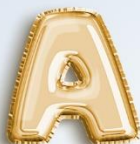
02 - Gold