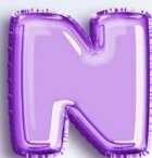
07 - Violet